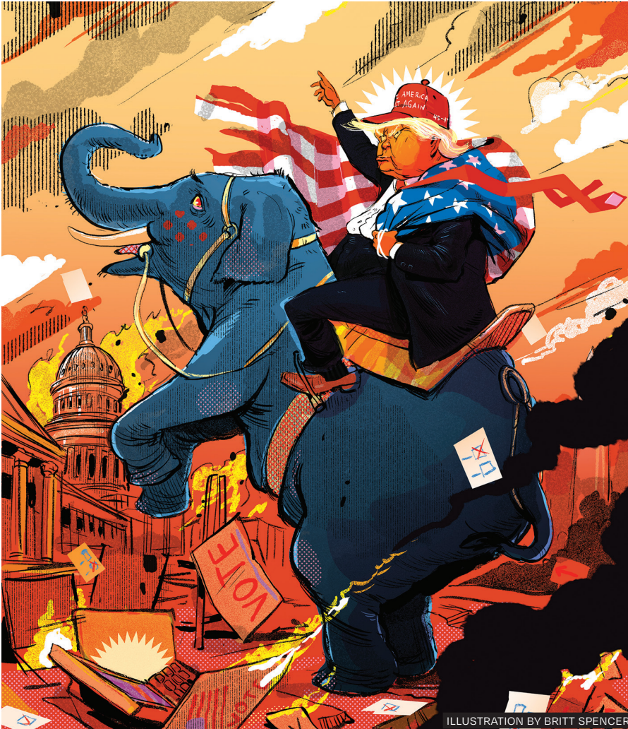
ILLUSTRATION BY BRITT SPENCER