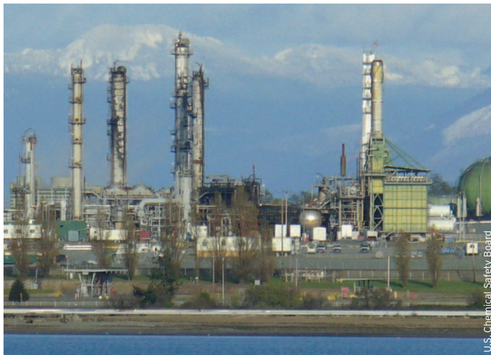
U.S. Chemical Safety Board

Refineries, such as Tesoro Corp's Anacortes location, have been the location of some of the most deadly disasters in the U.S. over the past decade.