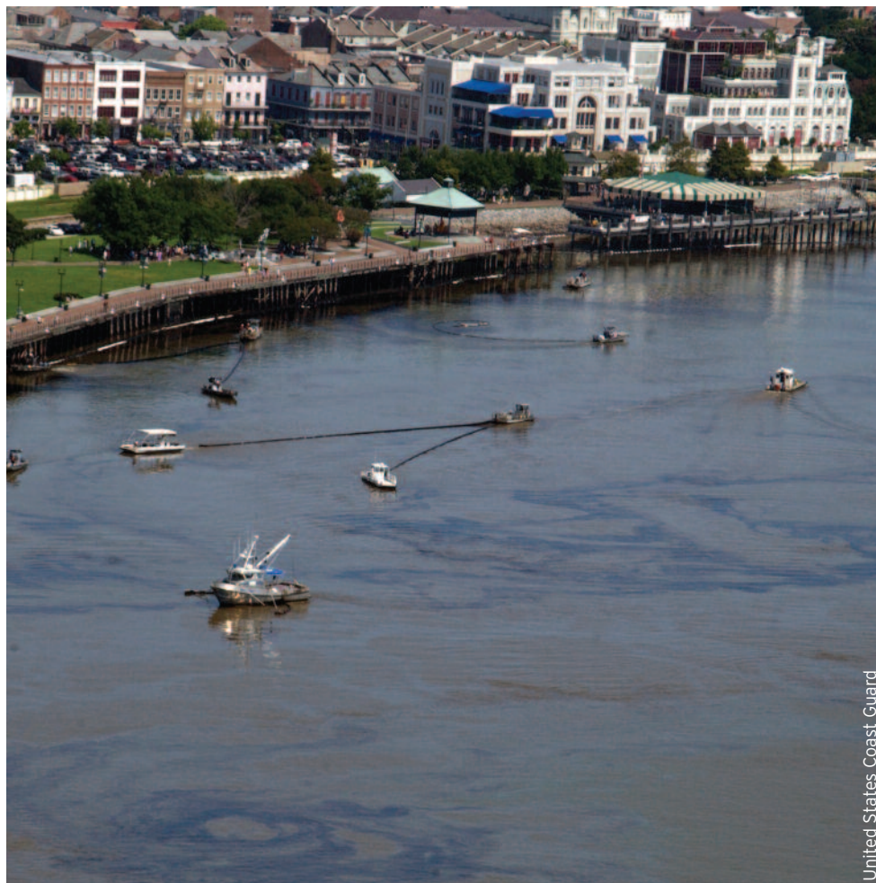
United States Coast Guard

fuel oil being spilled into the river at and below the Port of New Orleans, Louisiana . The chemical tanker MV Tintomara split an American Commercial Lines fuel barge in half, causing the spill and forcing the closure of a 58 mile stretch of the river south of New Orleans. All vessel traffic was halted and more than 2,000 responders worked on cleanup efforts for more than month. The barge was salvaged and about 100 miles of the affected river was cleaned. However, the National Oceanic and Atmospheric Administration (NOAA) reported for a time that more than 10 miles of “stranded oil” remained, as cleanup efforts were complicated by a six foot drop in river level. 66