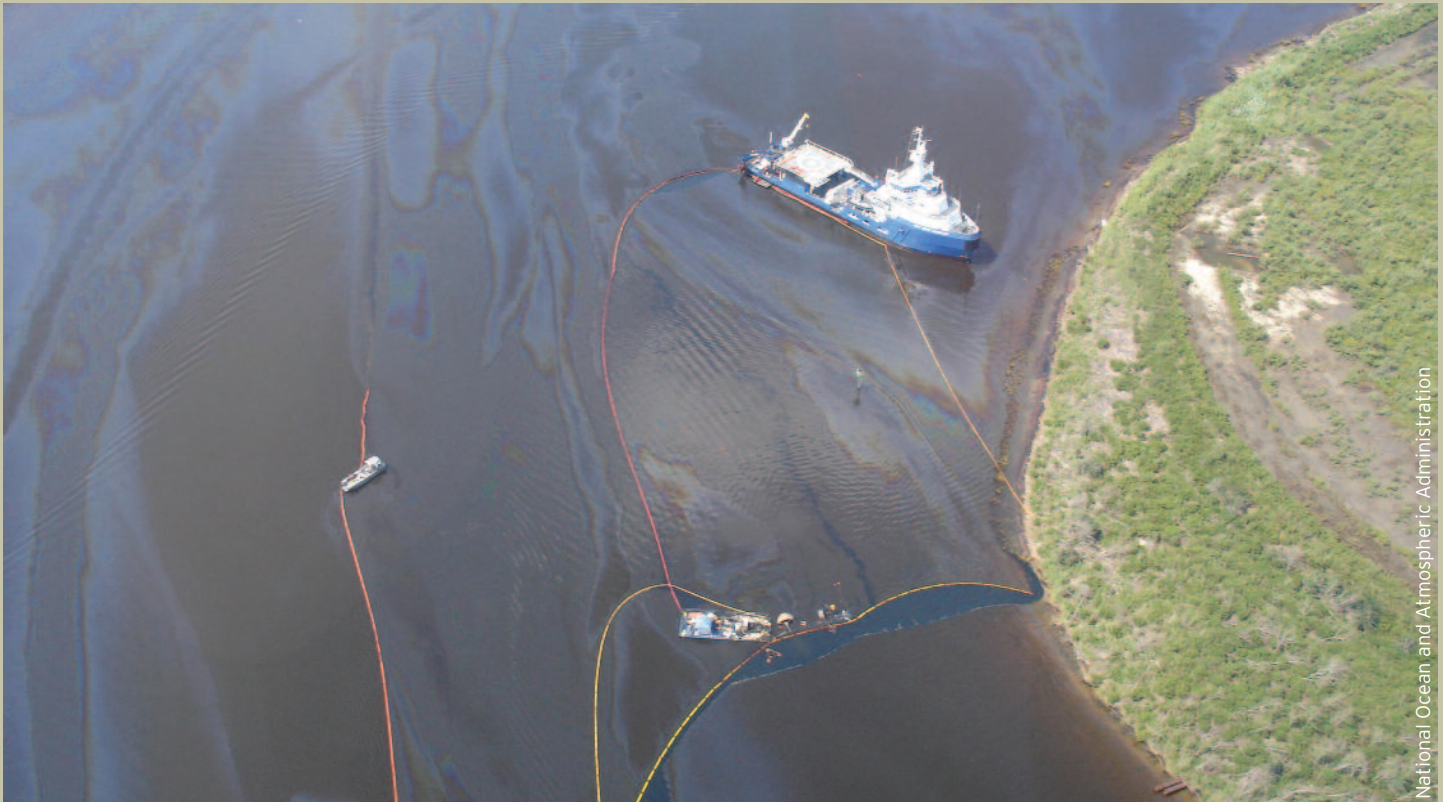
National Ocean and Atmospheric Administration

“Citgo knowingly misinformed government agencies of the status and capabilities of their waste water treatment unit.”