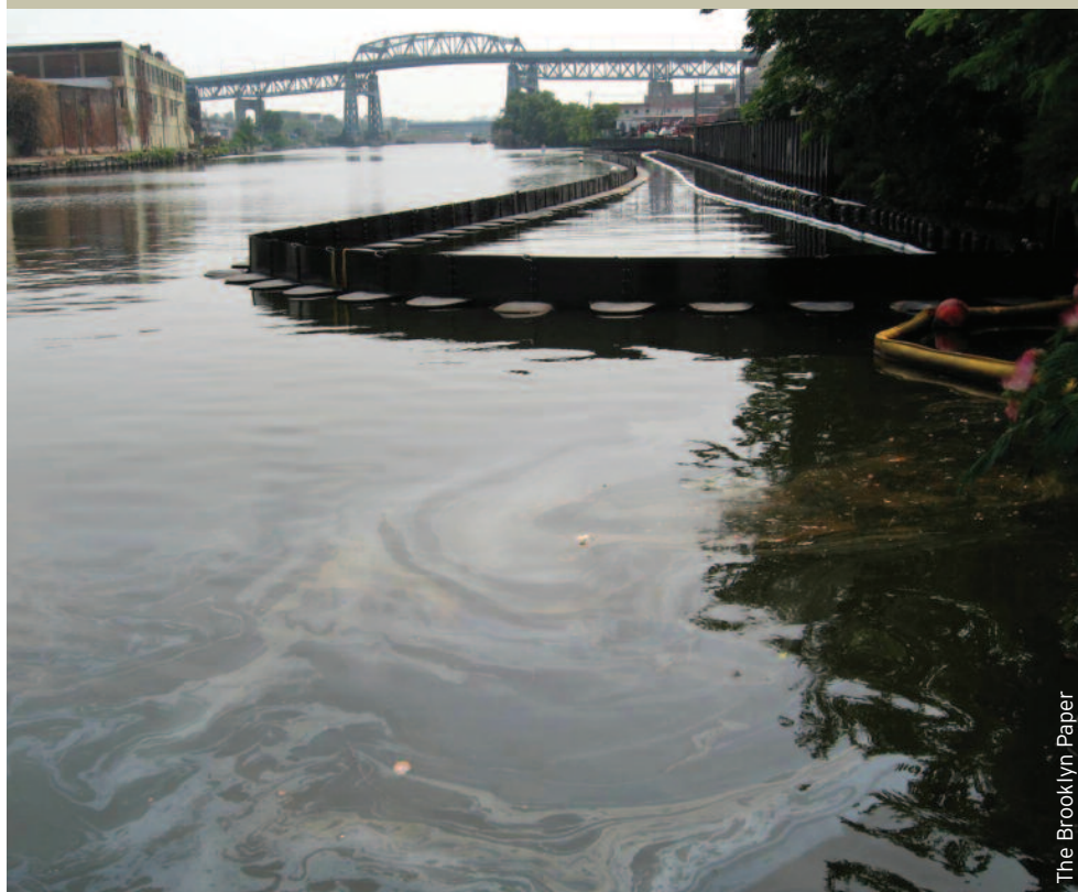
The Brooklyn Paper

On July 17th, 2007, New York State attorney general Andrew Cuomo filed a lawsuit against Exxon Mobil and four other companies ordering them to clean up a 57 year old oil spill that had formed a giant underground pool of mixed petroleum beneath the streets of Brooklyn, New York. The giant oil leak — variously estimated at between 17 and 30 million gallons — began sometime in the 1940s. Oil refining had begun in that part of the city as early as the 1860s but it wasn't until a gasoline explosion in 1950 that city officials were alerted to the seriousness of the problem.