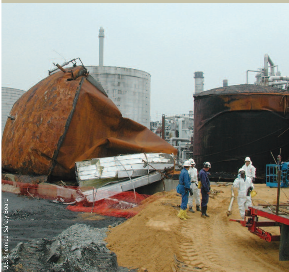
U.S. Chemical Safety Board

“Had any one of these elements been handled more effectively, this accident probably would not have occurred.”